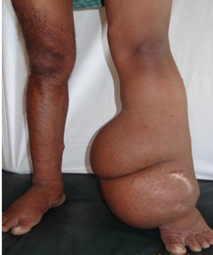
Image 1 showing Lymphedema of left lower limb