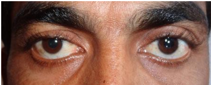
Image 2 showing double row of eyelashes